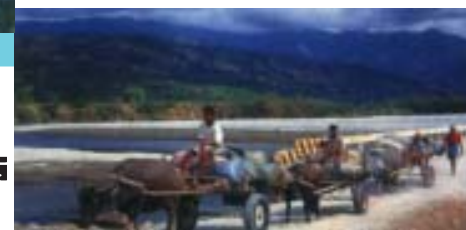
Livelihood projects, loans and grants

CESAR B. BAUTISTA , Ambassador Embassy of the Philippines, London April 2003