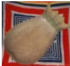
Mt. Pinatubo Ashglaze Stoneware

Maryland Resettlement - Pampanga (1994-present) Madapdap Aeta Ladies Group - Pampanga (1998-2007) Salay - Misamis Oriental (1999-2006) Bahi - Talisay, Cebu (2000-present) Paper Alley - Rizal (1998-2000) Castro Art - Quezon City (1999-2002) Glassart - Pasig (1999-present) Tagle Pottery Village - Tagaytay (1999-2001) Aksesoría - Quezon (1999-2001) Botolan Serpentine - Zambales (1997-99) Nature's Garden - Quezon Province (2000-present) Pandaquaqoi Resettlement - Pampanga (2001-2007) QJC Livelihood - Quezon City (2001-2004)